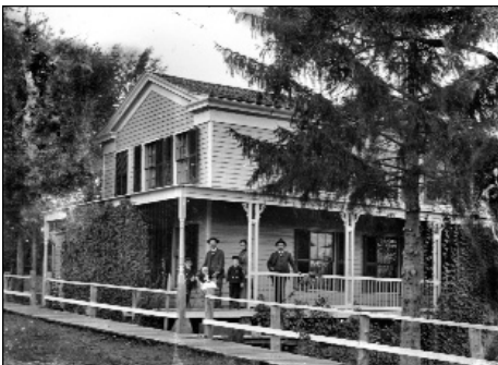
This house stands at the corner of Wisconsin and Doty Streets in Mineral Point, East of Farmers Savings Bank.